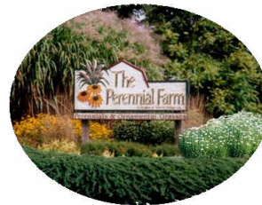
The highest quality plants