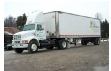
Deliveries, most locations every day

The Highest Quality - Best Customer Service - Fastest Delivery The Best ... Exceeding Your Expectations!