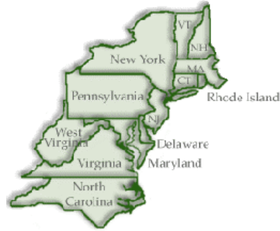
Fast, dependable delivery