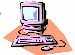
3 web sites, to help our customers