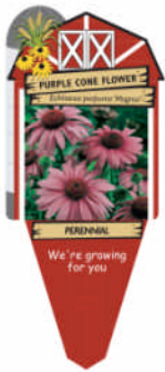
Big Barn Tag