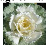
Osaka White Cabbage