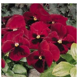
Penny Red w/black face