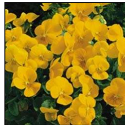
Penny Clear Yellow