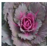
Color up Red Cabbage