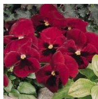
Penny Red w/black face