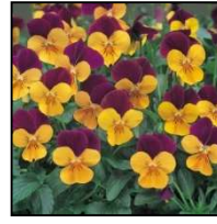
Penny Orange Jump-up