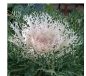
White Peacock Kale