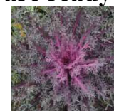
Red Peacock Kale