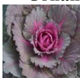
Color up Red Cabbage