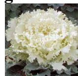
Nagoya White Kale