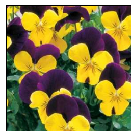
Penny Yellow Jump-up