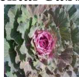
Osaka Red Cabbage