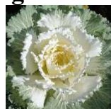
Osaka White Cabbage