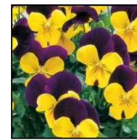
Penny Yellow Jump-up