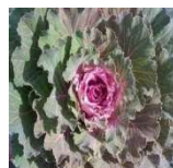
Osaka Red Cabbage