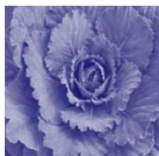
Color up Purple Cabbage