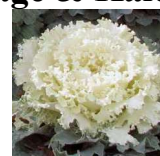
Nagoya White Kale