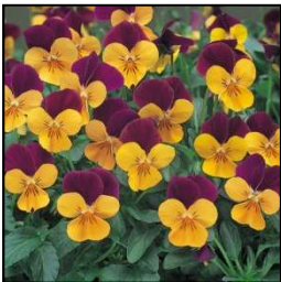
Penny Orange Jump-up